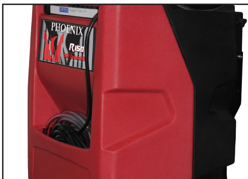
Convenient storage for power cord and drain hose.