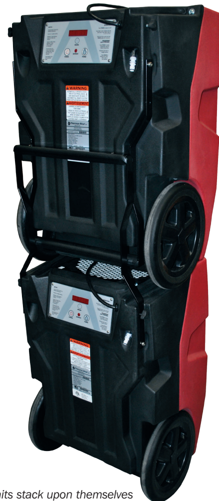
Units stack upon themselves for easy storage.

The R150 50Hz's outlet incorporates a wire duct collar for 25cm lay-flat duct. The outlet grill is also configured to accept a variety of thermo-hygrometers probes (e.g. Vaisala, Humiport, etc.) for taking accurate psychrometric readings. The 7.62m power cord and 10m condensate hose store conveniently in the front storage pocket.